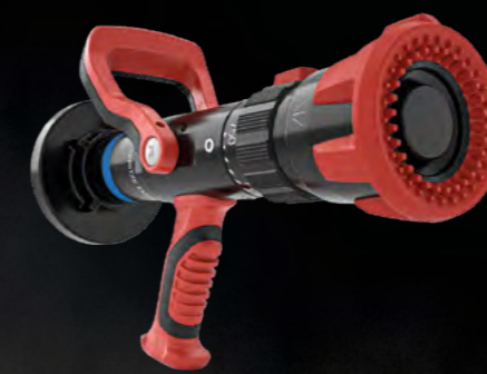
TURBO EVO 950 SPRITZE