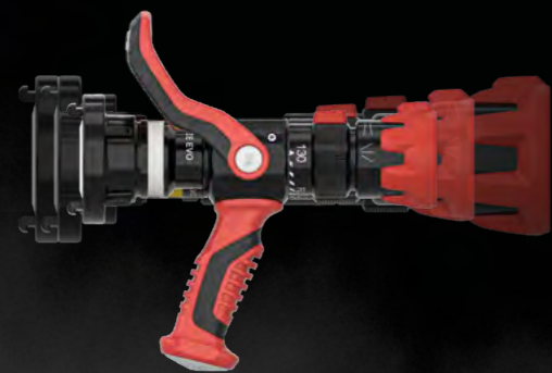
TURBO EVO 130 SPRITZE